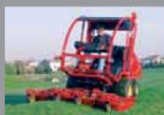
TURBO 5 50 HP