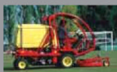
TURBO 1-1W-24 28-36 HP