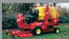
PG 20-30 HP