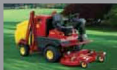
GT 22-30 HP