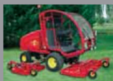
TURBO 6-6 FLAIL 60 HP