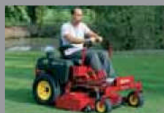
SRZ 15-27 HP