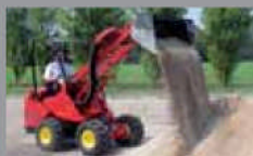
TURBOLOADER 28-36 HP